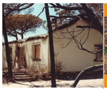
Burned house surrounded by greenery, which had no protection strip.